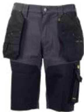
HAMDEN Grey/Black Short Available sizes: Waist: 30" - 42"