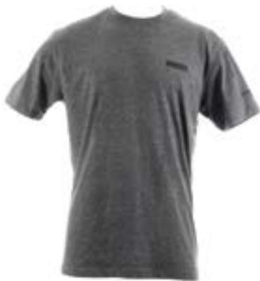
TYPHOON Charcoal Grey T-shirt Available sizes: M-XXL

Charcoal grey polycotton T-shirt with a ribbed crew neck for added comfort. Dewalt branding to chest & Guaranteed Tough logo to sleeve. Twin needle hem & cuff stitch.