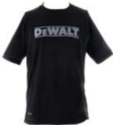
EASTON Black T-shirt Available sizes: M-XXL

Stay cool in the heat with this wicking Truro T Shirt from DEWALT. Crafted from Performance Wicking polyester, the lightweight design and mesh side and back panel to help airflow are ideal for keeping you cool on warm days.