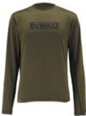
TRURO NEW Available sizes: M-XXL

Stay cool in the heat with this wicking Truro T Shirt from DEWALT. Crafted from Performance Wicking polyester, the lightweight design and mesh side and back panel to help airflow are ideal for keeping you cool on warm days.