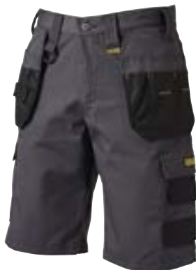
CHEVERLEY Grey Short Available sizes: Waist: 30" - 42"

A comfortable lightweight 100% polyester T-shirt with fast drying moisture wicking properties. Vented sides. Reflective Dewalt detail to chest. A garment to wear during those warm working hours or as an under garment during the winter.