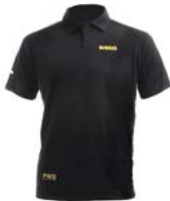
RUTLAND Grey/Black Polo Available sizes: M-XXL

Charcoal grey polycotton T-shirt with a ribbed crew neck for added comfort. Dewalt branding to chest & Guaranteed Tough logo to sleeve. Twin needle hem & cuff stitch.